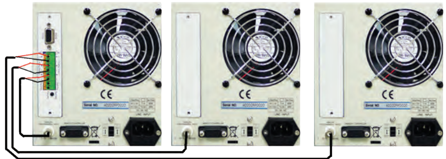
Multi-Load Parallel Operation

The CWG Option provides three identical analog outputs to drive up to three DC loads when higher currents are required. Additional loads can be added using BNC T-splitters if needed.