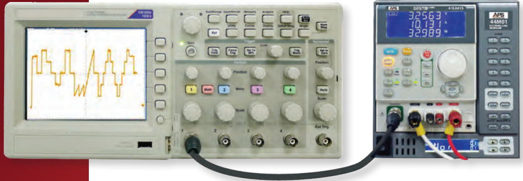
Option CWG Installed in 44M01 Mainframe