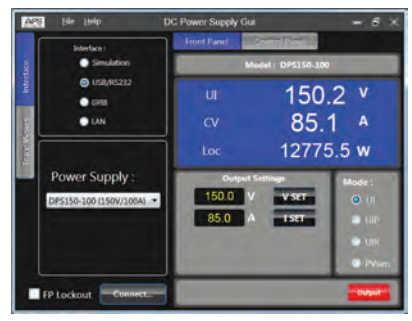
Interface Selection and Output Control Screen

Developed in C# on the Microsoft™ Visual Studio platform, the APS DC Power Supply GUI program is fully compatible with both Windows 7 and Windows 8 and takes full advantage of 64 bit technology and advanced functions like multi-threading to guery measurement data in the background while the user interacts with the program.