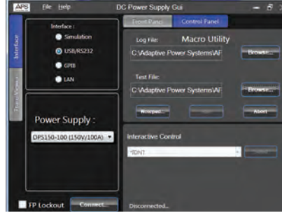
Test Script Execution and Interactive Command Line Screen