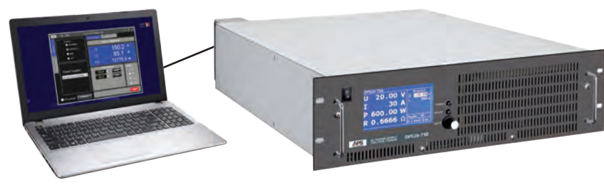
Computer Controlled DC Power Supply